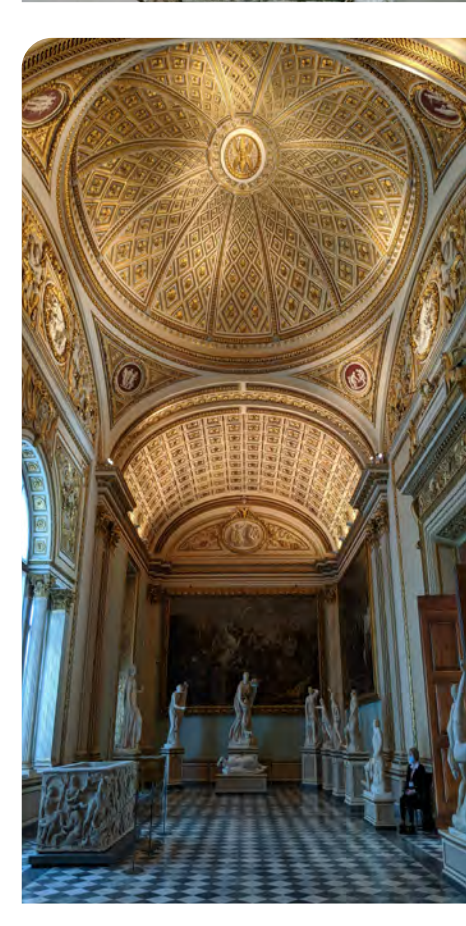
Beauties of Florence